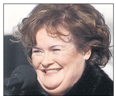
Susan Boyle — question 8.