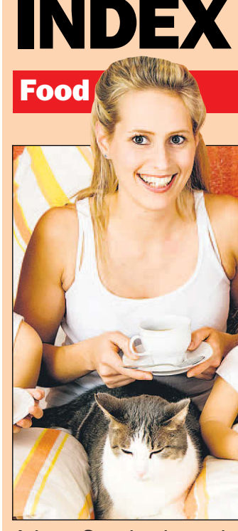
A lazy Sunday brunch the whole family will enjoy — P48